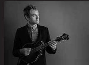
HOST: Chris Thile