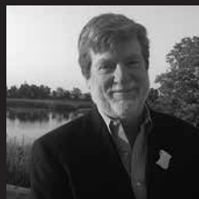
HOST: Neal Conan

TUE - THU, ONCE DURING MORNING EDITION, ONCE DURING ALL THINGS CONSIDERED