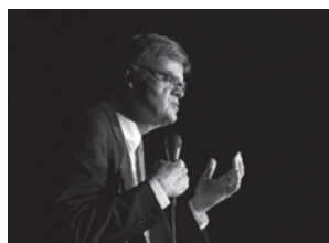
HOST: Garrison Keillor

MON - FRI 9AM DURING MORNING CAFÉ; 7:06PM DURING EVENING CONCERT