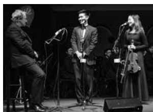
Christopher O'Riley with Hawaii Youth Symphony