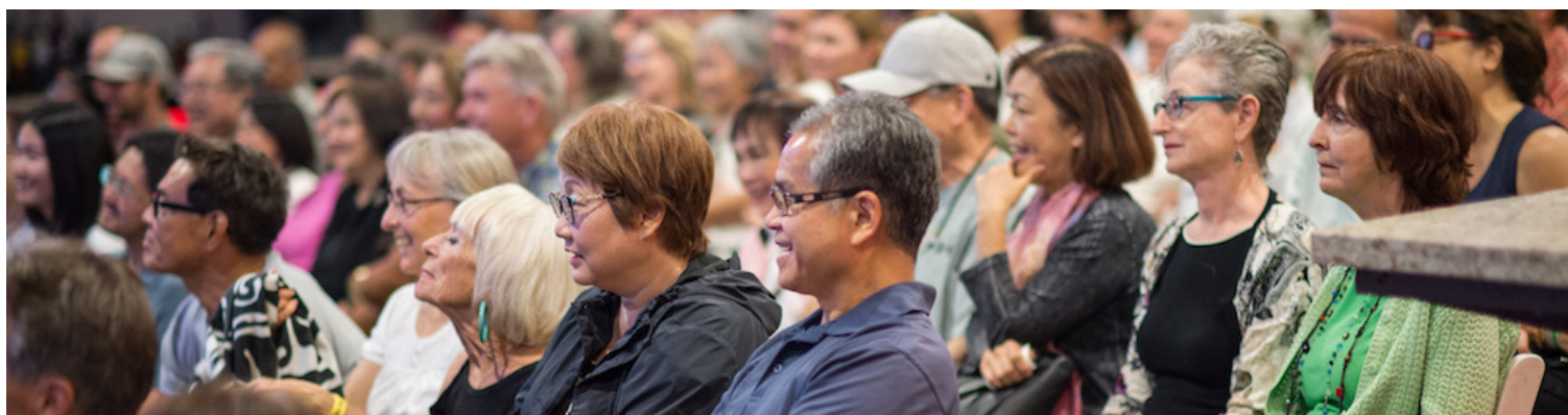
Zócalo Talk Story Event

Through their actions and ideology, NPR listeners demonstrate a higher level of social consciousness than the rest of the U.S. population.